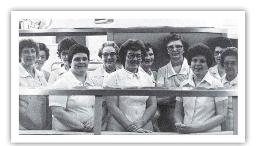
Lunch Ladies - 1979

Alumni, this is your newsletter, if you have any general news or class reunion information that you would like to have published please email that information to <u>fhsnealum@gmail.com</u> or mail it to me at 2231 E Dodge St., Fremont NE 68025. I would love to help promote your upcoming events and help you get the best turnout possible. 📽