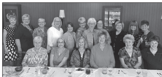
Ladies from the of Class of 1965