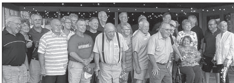
Class of 1963