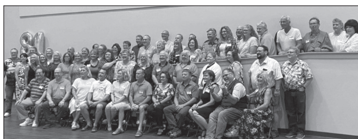
Class of 1981