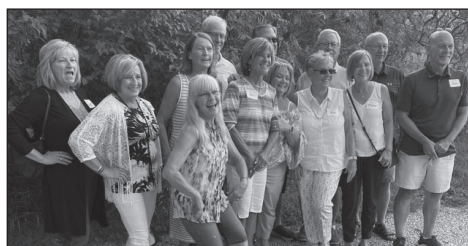
Class of 1969