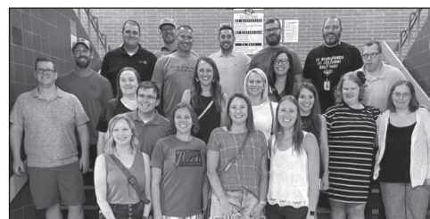
Class of 2001