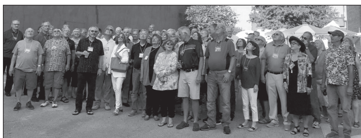
Class of 1971