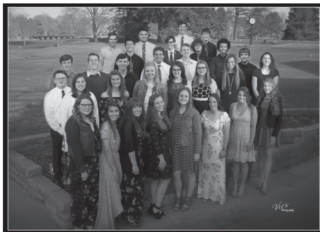
Class of 2019 Academic Achievement Honorees

Students and mentors were recognized and were all presented with a gift from the Foundation. ★