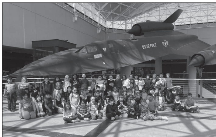
Picture Caption: Linden Second Graders Enjoying Their Day at the SAC Museum

(*Please note: Those requests not selected for a Creative Teaching Grant are posted on the FPS Foundation "Making a Difference" webpage ( https://fpsfoundation.com/fps-campaigns/ ) for possible funding!) ★