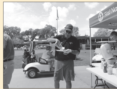
First National Bank donated and cooked brats for the players' lunch