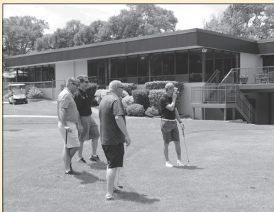
S2 Roll-Off Team contemplates their strategy on Hole #10