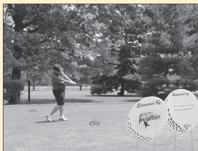
Hole #1 – Where the fun begins!

The 2020 event is scheduled for Monday, July 13th , so mark your calendar now, and get your team together for a fun day for a great cause! ★