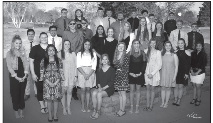
Class of 2018 Academic Achievement Honorees

Students and mentors were recognized and were all presented with a gift from the Foundation. ★