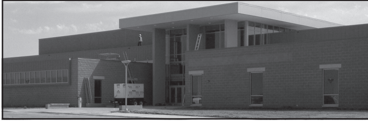
Nearly completed front entrance of the new Johnson Crossing Academic Center.