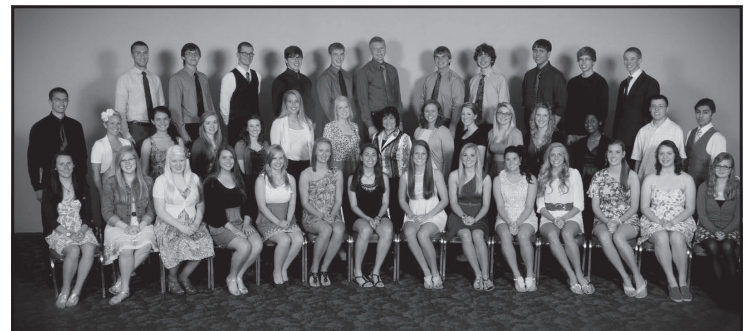
2012 honored graduates along with Nebraska First Lady Sally Ganem.

The honored students each received a brief case/laptop bag bearing the foundation's emblem, and a picture of themselves receiving the gift from First Lady Sally Ganem. ★