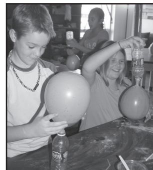
Johnson Crossing students enjoy a science experiment in their new facility.