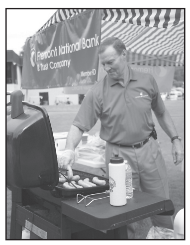
One of many sponsors, Fremont National Bank provided brats and hot dogs at the #9 tee box.

The annual Fremont Public School Foundation Golf Tourney was played on July 29th in nearly perfect weather conditions for the third year in a row. Teams of FPS supporters representing FPS alums, parents, faculty, and businesses enjoyed the great day and the opportunity to play on the pristine Fremont Golf Club course. Tourney winners were representative of the wide variety of FPS supporters who enjoyed the day and helped raise funds in support of the