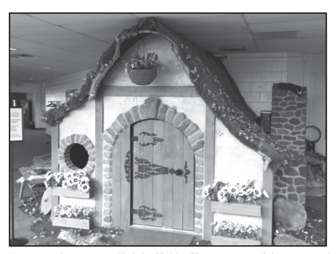
A quiet reading room called the Hobbit House is part of the courtyard.