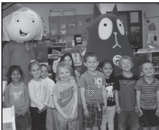
Milliken Park pre-school students share a fun day with their NETV friends

The program was made possible through a grant from the State Department of Education, and was supported with additional funding from the Fremont Community Foundation and the Fremont Public School Foundation. Three full-time early childhood teachers have been